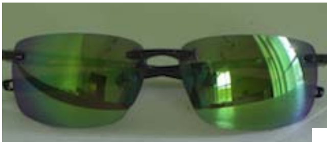
Sun Glasses valued at $180 Donated by Monson Optical