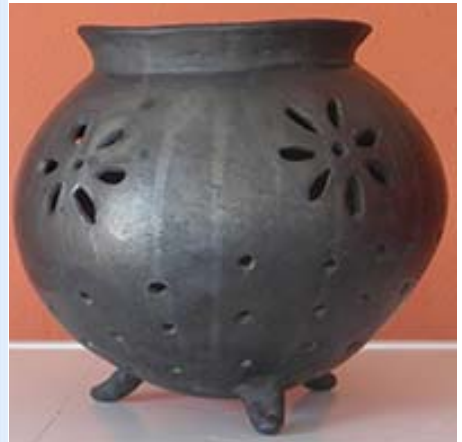
Vintage Barro Negro Pot from Oaxaca.