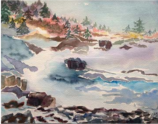
Tara Hengeveld • Watercolor Memories of Digby, NS