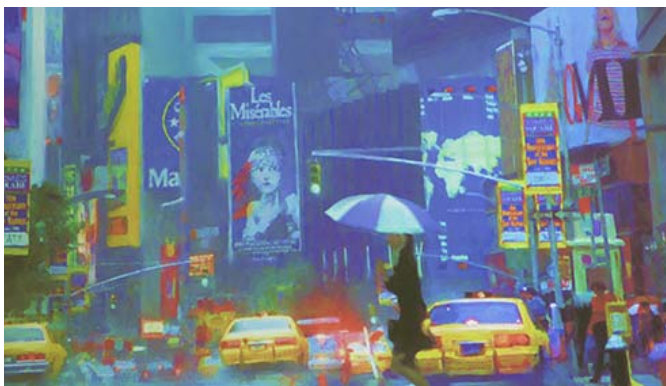
This Digital Image by Rich Swiatlowski was the national winner in a Photographic Competition. It placed First over 60,000 entries.